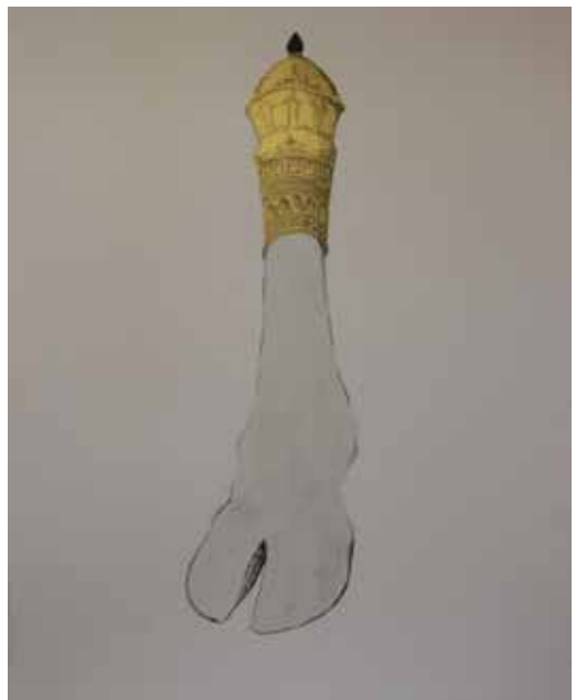
Drawing of a Hoof 2011 acrylic and ink on cardboard 40.6 x 33cm