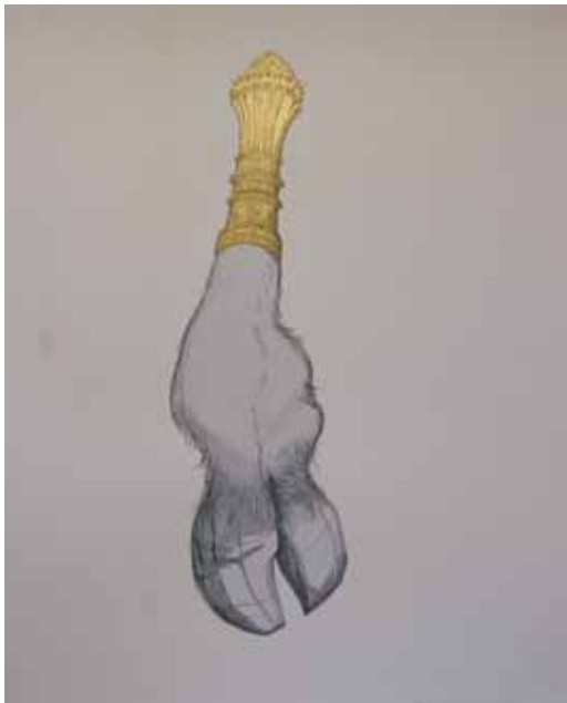
Drawing of a Hoof 2011 acrylic and ink on cardboard 40.6 x 33cm