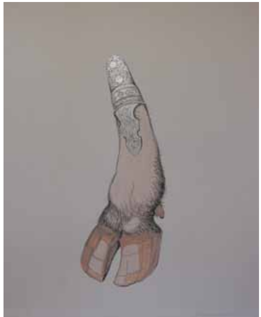
Drawing of a Hoof 2011 acrylic and ink on cardboard 40.6 x 33cm