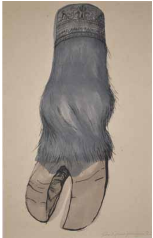
Selected Drawings of a Hoof 2010 pen and ink on paper 20 x 15cm