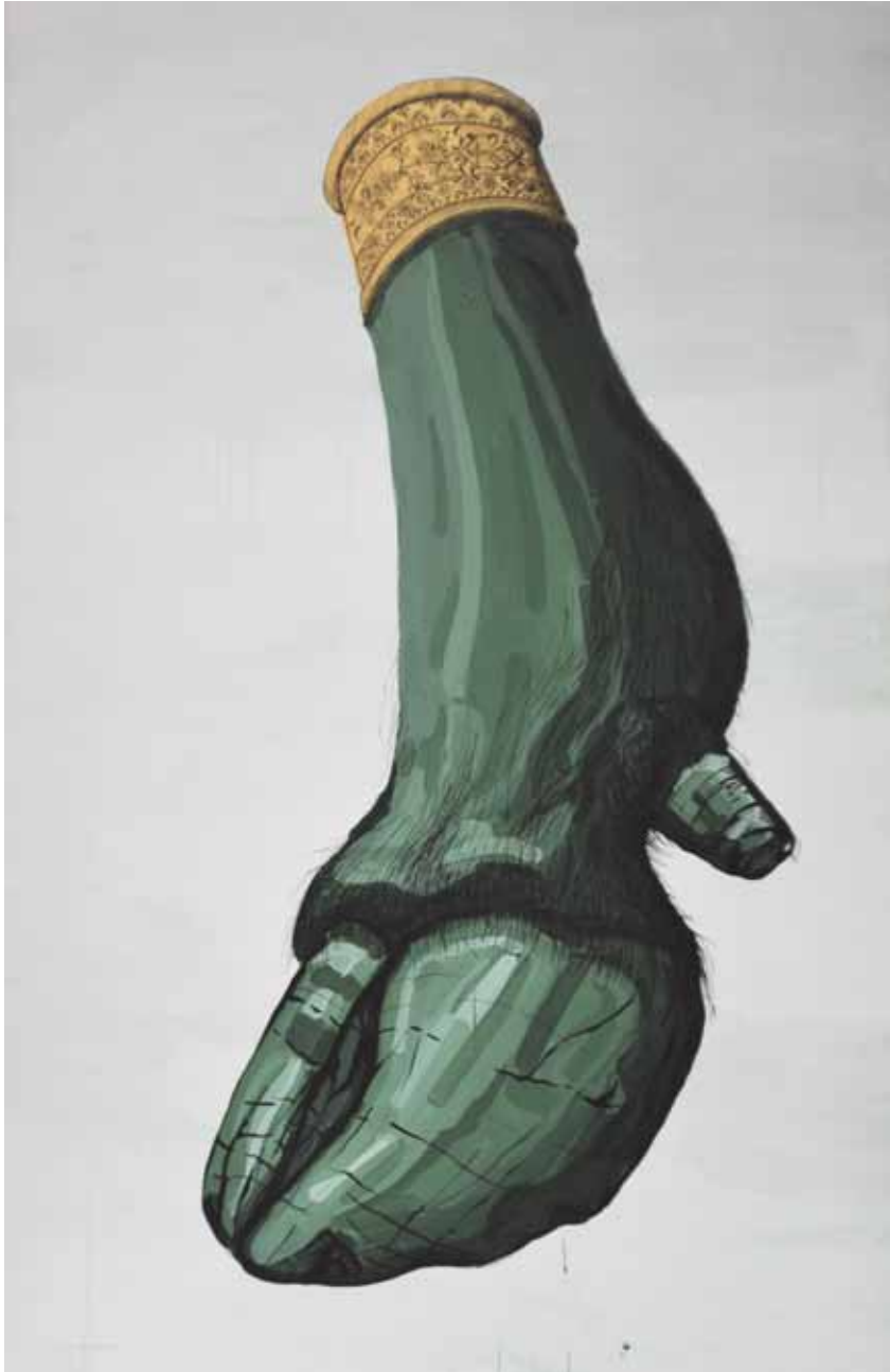
The Hoof 2010 acrylic on canvas 190 x 110cm