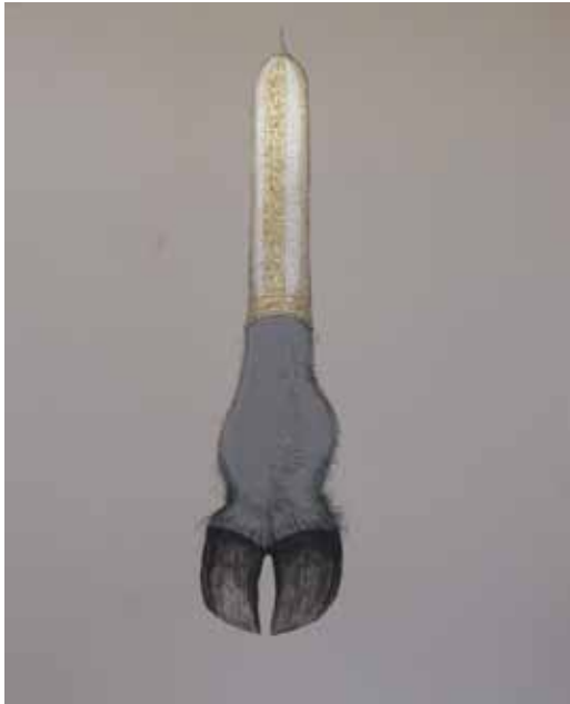
Drawing of a Hoof 2011 acrylic and ink on cardboard 40.6 x 33cm