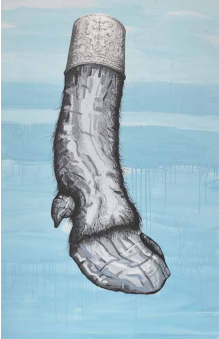
The Hoof 2010 acrylic on canvas 190 x 110cm