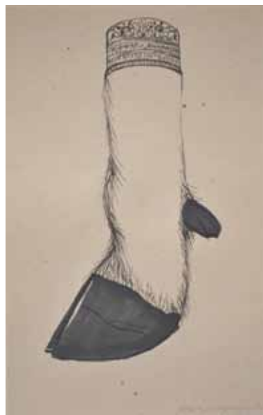
Selected Drawings of a Hoof 2010 pen and ink on paper 20 x 15cm